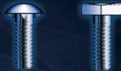
Round Head Tank Bolts GR 8.2